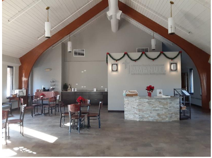
New & Improved Narthex