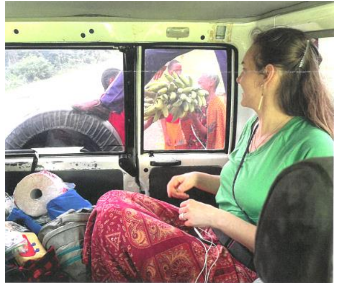
Our driver loading food on the luggage rack on top of the Land Cruiser.

Much of our work this year is figuring out how to live in a new country. This month's theme is "getting around." In a previous month's newsletter, I shared pictures of our walk to school. We walk and walk to get places. We purposely rented a house this first year in a location where we can walk to the boys' school, to the "sokoni" (market) and the "kijiji" (the downtown area) in order to be able to get the basic necessities. Besides walking, we take "bajaji" (three-wheeled motorcycle) and taxi. Also, the church here in Tanzania will send a Land Cruiser for us to borrow with a driver for longer