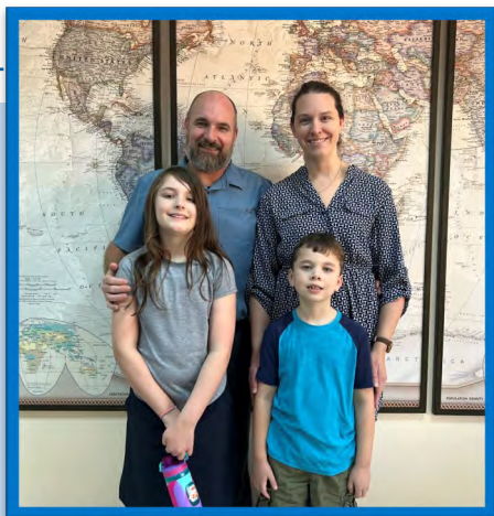
The Paynes at the LCMS Africa field office.