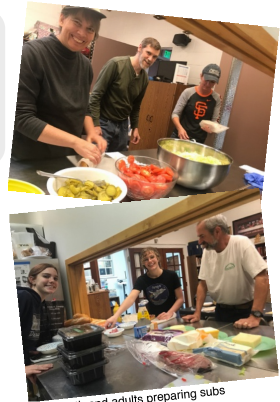
youth and adults preparing subs