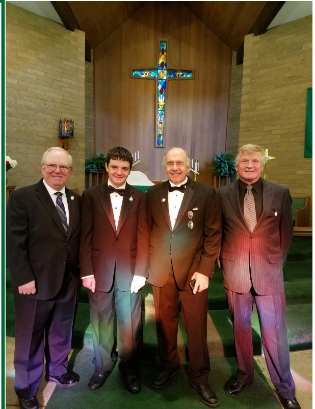
Some of our hard working ushers on Sunday morning.

The Restaurant is located at 4800 Golf Course Rd., Antioch, CA, 94531.