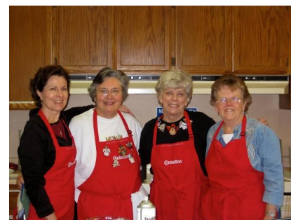
CORNER CAFÉ 2015

gives us many opportunities to share the Gospel during this time, e.g., when we write Christmas cards, exchange pleasantries with store employees, prayers at Christmas dinner. And should the Spirit bless us with the opportunity for deeper conversation, we can point out that Christmas has meaning because of Good Friday and that the birth of Christ would not have any consequence were it not for His crucifixion where He stared sin in the eye and atoned for the sins of the world — including your sins and mine — with His own precious, innocent blood.