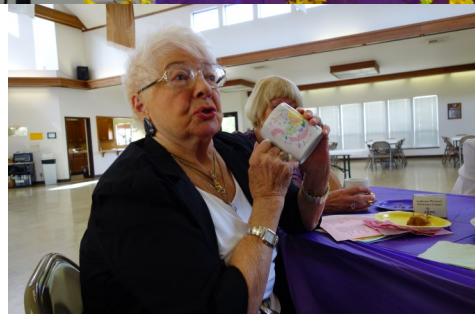
MORE MUGS AND MUFFINS