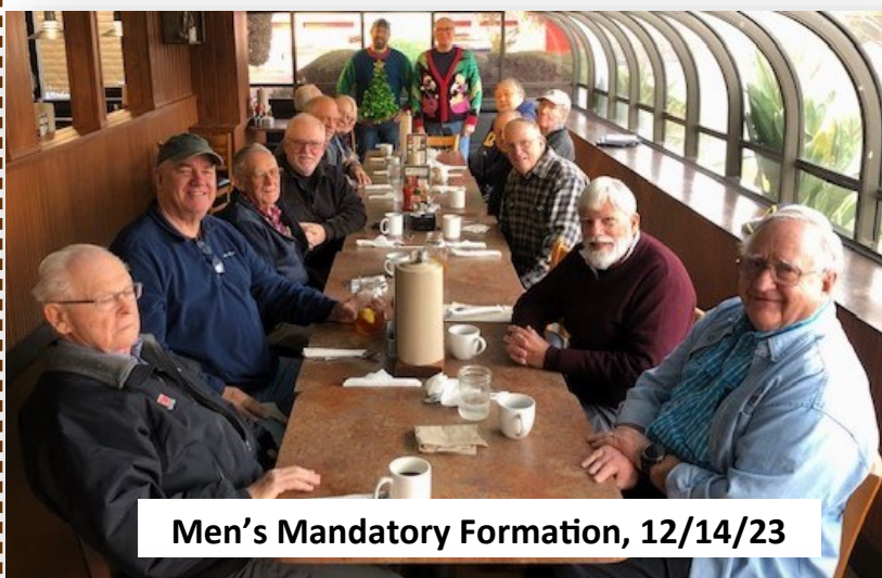
Men's Mandatory Formation, 12/14/23

If you have an interest in brewing, spectating, or sampling, or you enjoy haute cuisine, reach out to the MLBG to be part of the fun. Join the Guild!