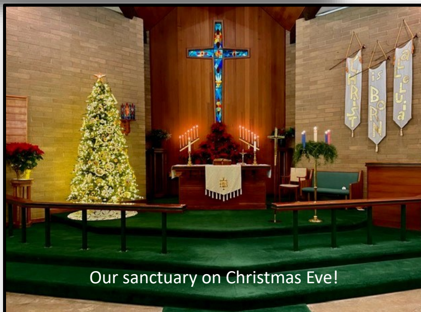
Our sanctuary on Christmas Eve!