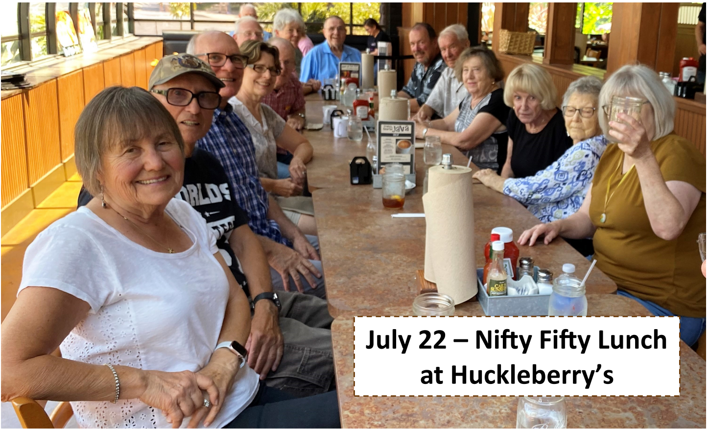
July 22 – Nifty Fifty Lunch at Huckleberry's