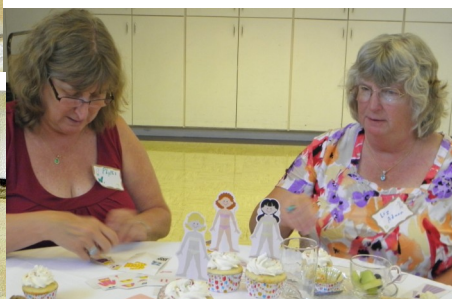
Dressing Paper Dolls, not only for young girls!