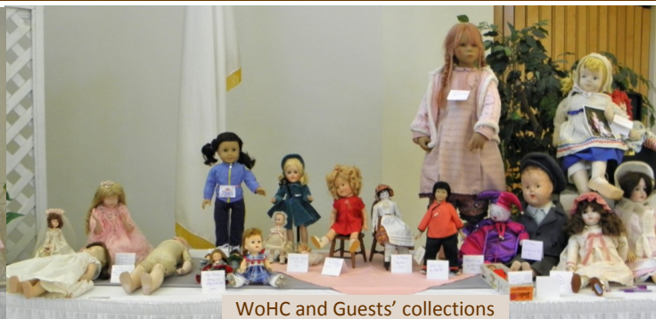
WoHC and Guests' collections