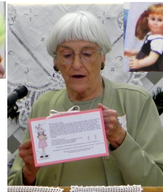
Devotion: different dolls, relating their specific personalities to Scripture.