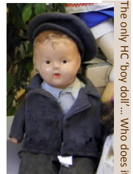
The only HC 'boy doll' ... Who does it belong to? Ans. on pg 6

Thanks again to everyone who contributed to this fun and informational event. We walked away feeling very comforted and loved by God and each other.