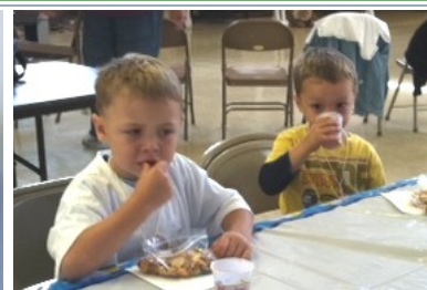
VBS (Continued from page 6)

of cookies for dessert. Thank you ALL Vacation Bible School VOLUNTEERS for your time and dedication in sharing God's love with these young children. God bless you all! ~Grace Gin