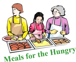
Meals for the Hungry