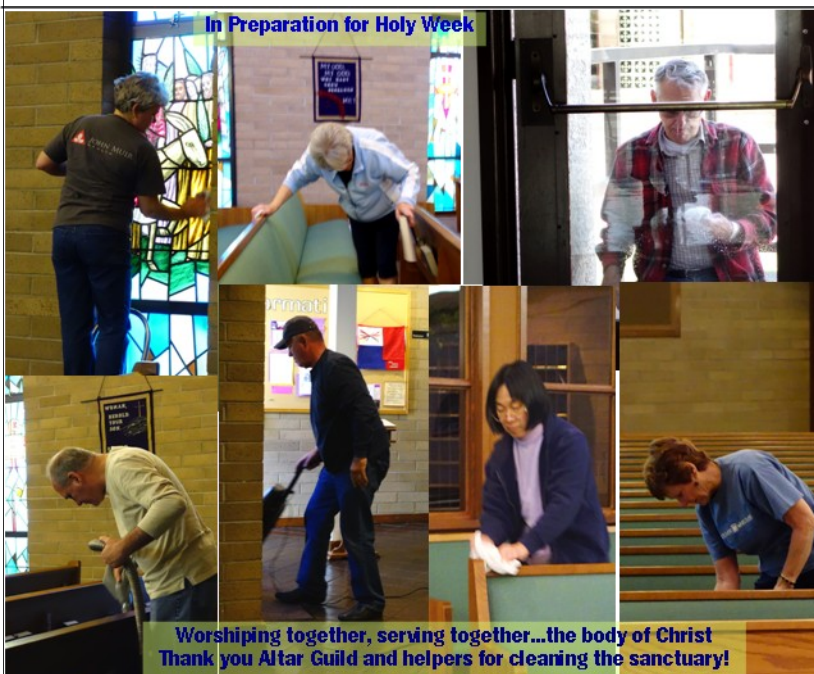
Worshiping together, serving together...the body of Christ Thank you Altar Guild and helpers for cleaning the sanctuary!