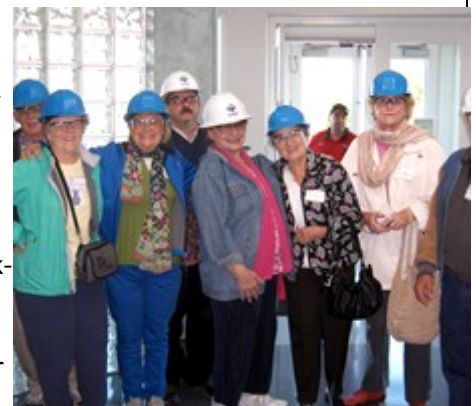
HC NF group on CCWD tour, Story next page

and other members of our church. What a lunch it was starting with appetizers of sausage cheese scrimp etc. Everyone ordered according to their desires. Sauerbraten, Braised Beef Ti Tip aged and marinated in Red Wine & Secret Spices served with Red Cabbage & Spatzel and so on, a few had a half liter of beer (they ordered six different kinds of beer and they were served in six different shaped ice cold mugs). Trudy picked up the tab for the whole lunch. We had a gorgeous Birthday Cake for dessert. We all toasted Trudy and wished her a very HAPPY BIRTHDAY! It was truly an excellent outing and lunch. See what you missed! ♦