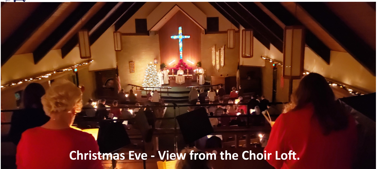
Christmas Eve - View from the Choir Loft.

Please join the Altar Guild to take down the Christmas decorations on Jan 5th at 9 am. It goes quick with many helping hands!