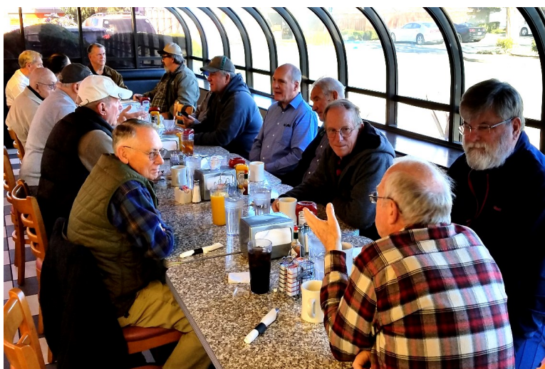
FEBRUARY MEN'S KOFFE KLATCH

The kids Easter egg hunt will be at 9:30.