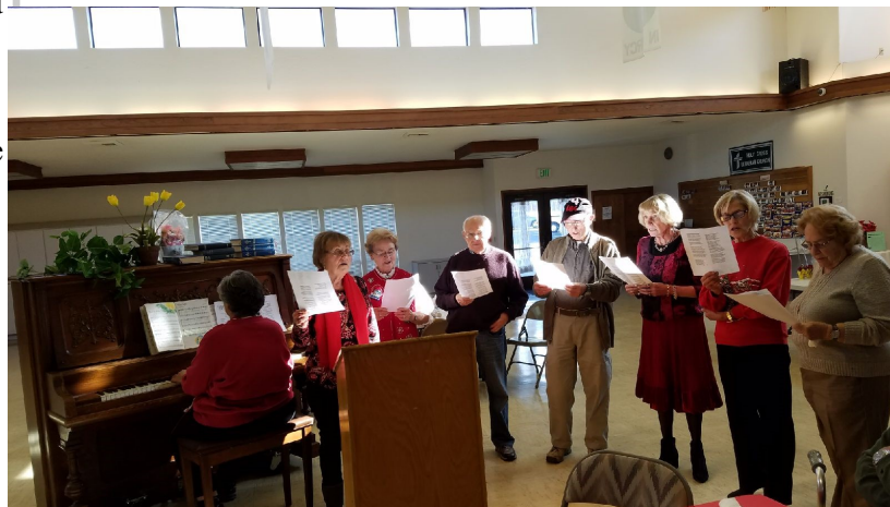
Our German singers