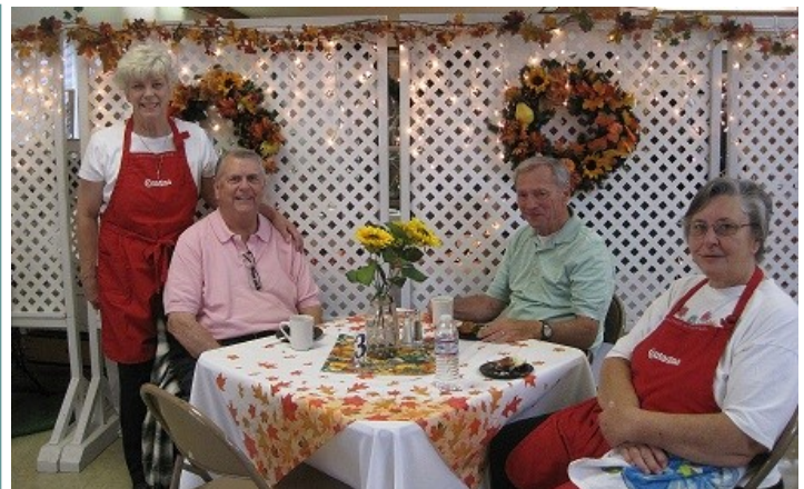
Members enjoying an early morning HOMEMADE sweet roll at the Holy Cross Corner Cafe." 2017

CHOIR REHEARSALS for December will be on Dec. 5, 12, and 19. Dec. 19 will begin at 7:00 pm. No rehearsals on Dec. 26 & Jan. 2.