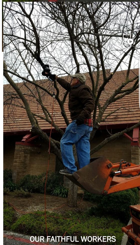
OUR FAITHFUL WORKERS