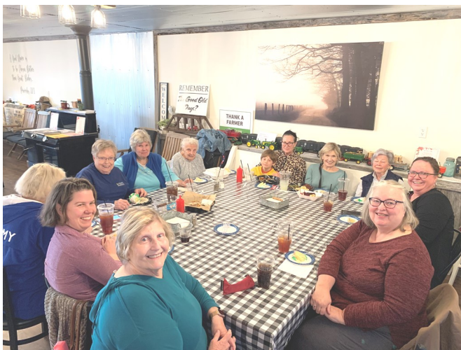
Ladies Lunch Out at the Farm Table April 8, 2022

The Day-Timers will meet on Wednesday, May 11 at 9:30am.