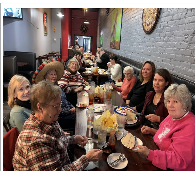
Ladies Lunch Out at Cocina de Mama Shelbyville - January 10, 2022