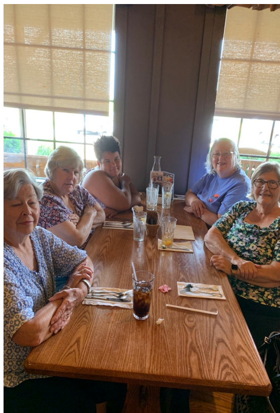
Ladies Lunch Out at Cracker Barrel, July 22, 2021

Volunteer service has been a hallmark of Holy Cross' life together. We have so many people offering so many gifts, it is wonderful! For the past year plus our regular volunteer schedule for acolytes, readers, nursery workers, and Sunday School teachers have read "N/A." We are excited to start putting names back into that schedule! To do so, we need to hear from you that you are ready to pick up that work again. This is a great time to join the rolls of a new service, too. Let us know!