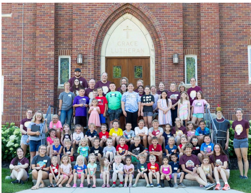
Keepers of the Kingdom 2023