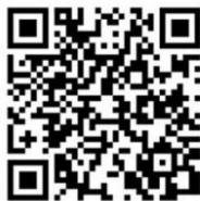
Vanco QR Code