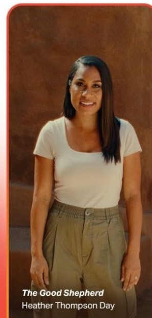
The Good Shepherd Heather Thompson Day