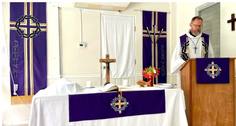
The new paraments and the new stole matching the banners made new last year.

This month we've had the privilege to meet some of the pre-covid snowbirds that had regularly attended Safe Harbour especially in the winter! We've had people from Minnesota, Michigan, Wisconsin, and Indiana fill up our worship space every Sunday!