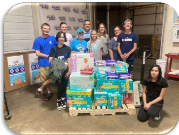
Serve @ Diaper Bank