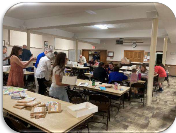
Birthday Kit Family Service Project