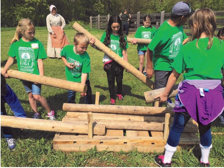
The 3rd and 4th graders enjoyed loading an ox cart at Old World Wisconsin.

School is out for summer vacation now, but the students were very busy enjoying field trips and track meets during the last several weeks of the school year.