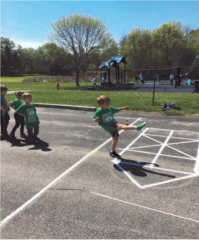
The shoe kick is fun for PreK 4 student Josh Grelk.