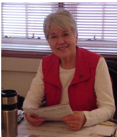
Parish Nursing Notes.....