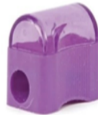
One pencil sharpener