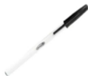
Five black or blue ballpoint pens