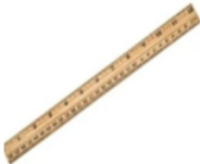
One 30-centimeter ruler