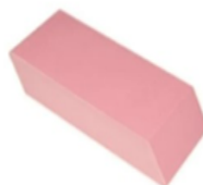
One 2 1/2" eraser