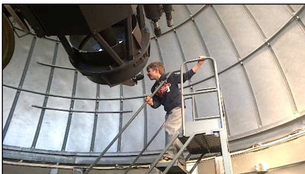
A young boy beholds the universe at the Goldendale Observatory

Whether it's viewing the splendor of God's creation from a huge telescope, worshipping at an authentic Greek monastery or viewing the crown jewels of Romania it will all be possible for you and your family the first weekend in October. Not to mention – a visit to the world's only life-sized version of Stonehenge the way it looked thousands of years ago! Plus a chance to sample fine wines at the Maryhill Winery, an art