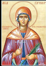
Sunday of the Man Born Blind

THE DIVINE LITURGY OF ST. JOHN CHRYSOSTOM WILL BE CELEBRATED TODAY