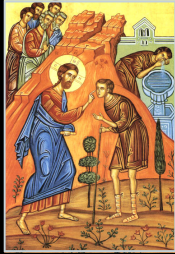
Sunday of the Man Born Blind

THE DIVINE LITURGY OF ST. JOHN CHRYSOSTOM WILL BE CELEBRATED TODAY