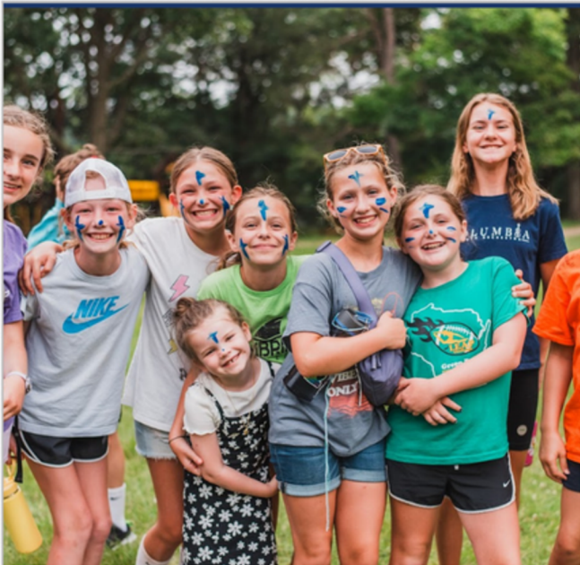
Camp Week (Grades 1st-12th) @ Pine Lake July 6-11, 2025