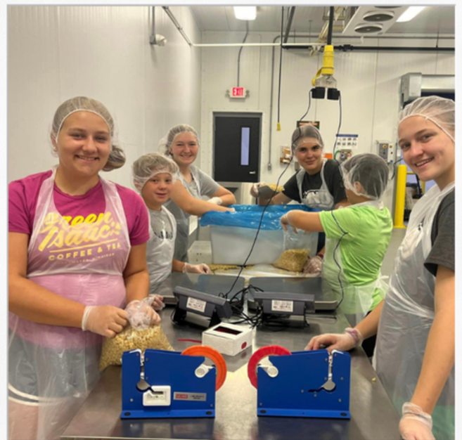
MS Service-Learning Retreat Greater Green Bay Area July 20-23, 2025