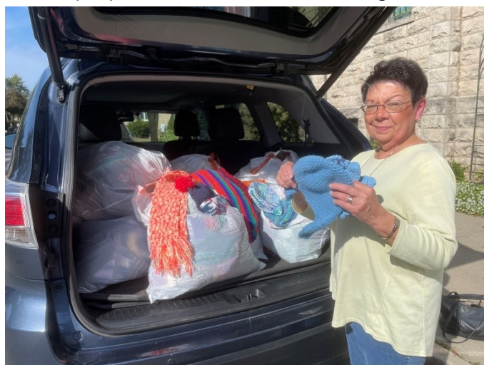
Member Care delivered yarn items for Afghan refugees