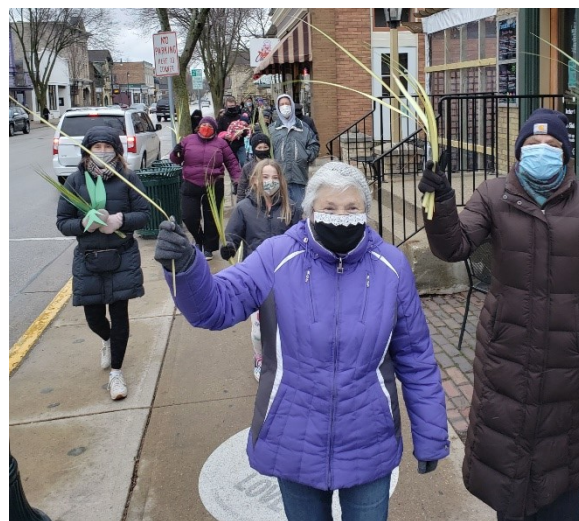
Members process along Washington Ave for Palm Sunday