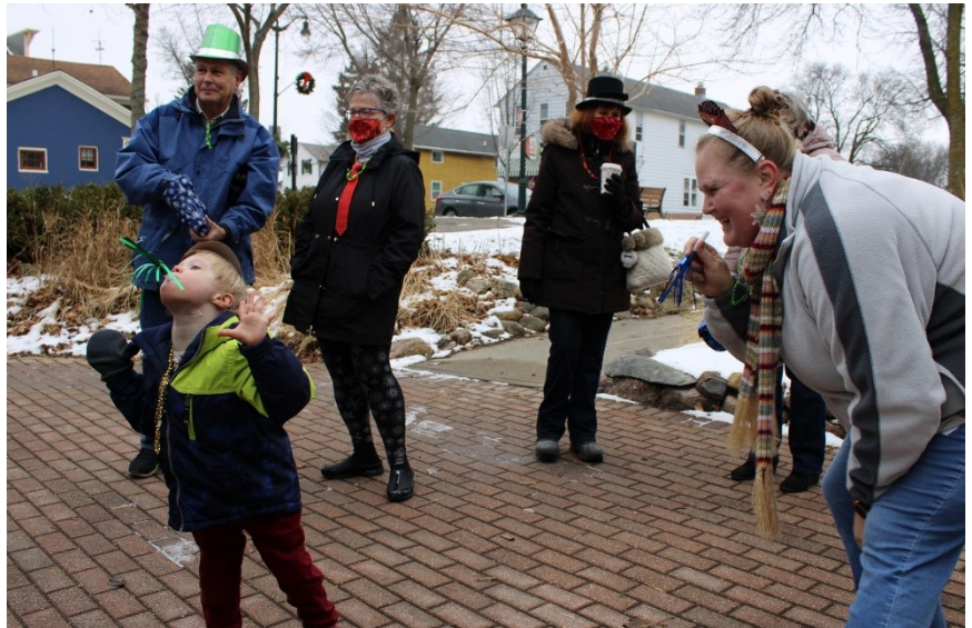
Ring in the new year at the New Year's at Noon celebration