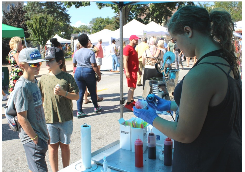
Snow cones by freewill donation were popular and generated a lot of attention and monies for MABO at the Wine & Harvest Festival

Cedarburg resumed its Wine and Harvest Festival in September of 2021, and Advent participated with the MABO Rummage Sale and also provided the opportunity for Advent to open its doors to families with young children who needed a feeding and changing station. Every family that took advantage of the two rooms was very appreciative of the quiet, clean, and safe space to care for their children. The Festival's Committee organized this portion of our participation in the Wine and Harvest Festival and we are grateful for the Advent volunteers that supported this outreach to the Cedarburg community.