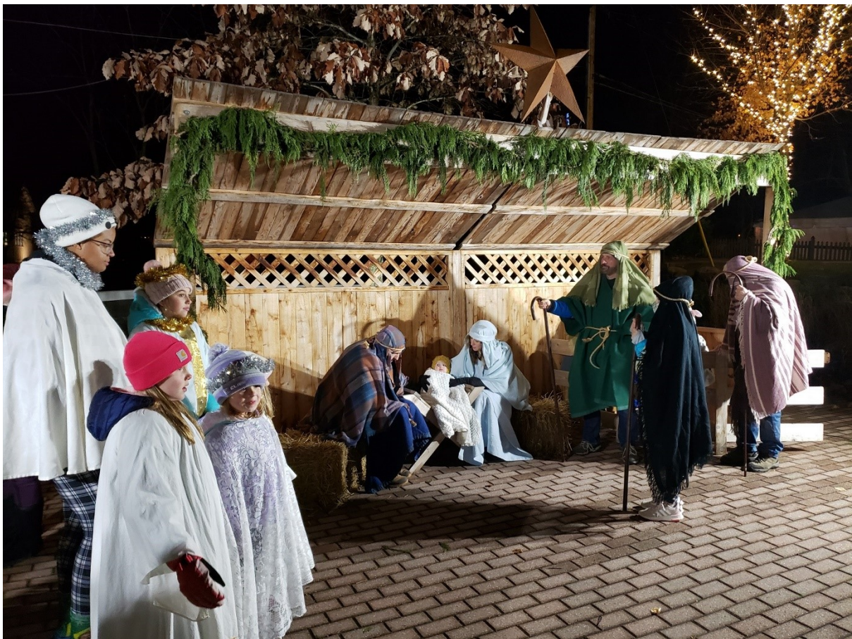
All-ages cast of the Live Nativity