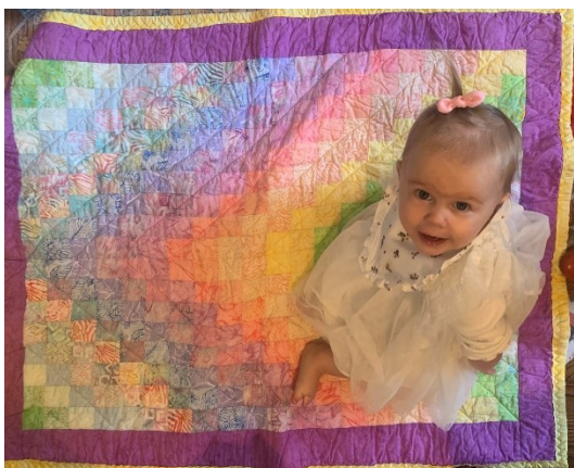
Beautiful baptismal quilt made by the women in the WIGBACK program