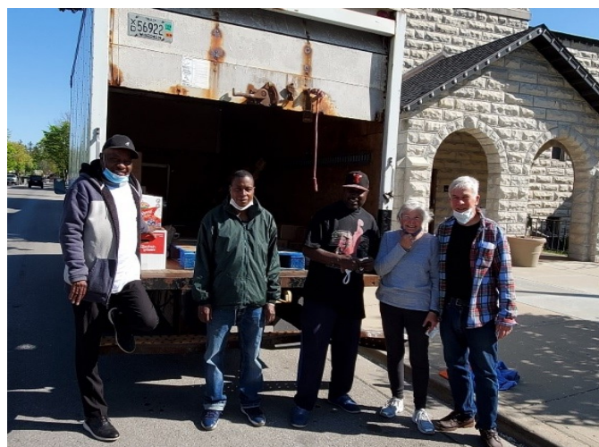
Easter collects pantry items with others from Cross