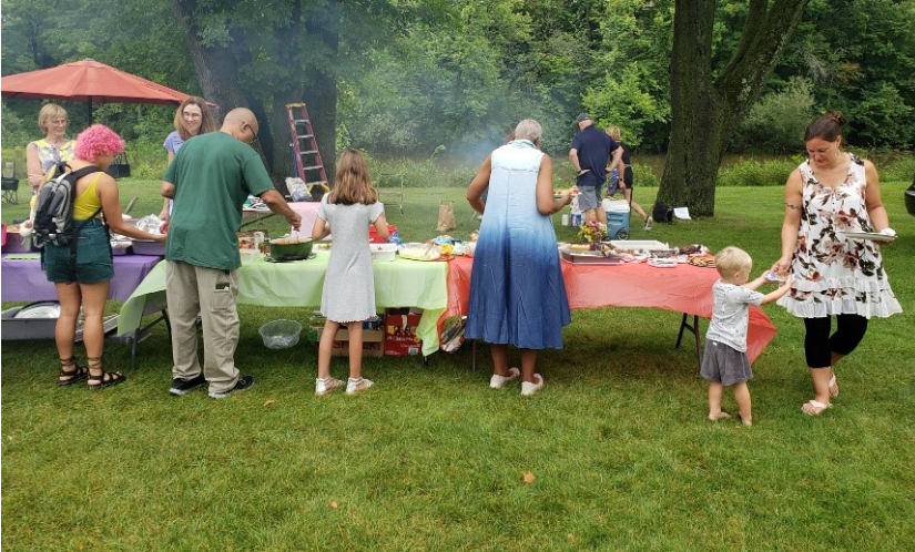
Annual Church Picnic with partners from Cross Church

Although we were disappointed that we weren't able to gather together once again this year to celebrate the risen Christ with an Easter Breakfast, we are thankful that we were able to celebrate his resurrection with a sunrise service outside as well as the online workshop service.