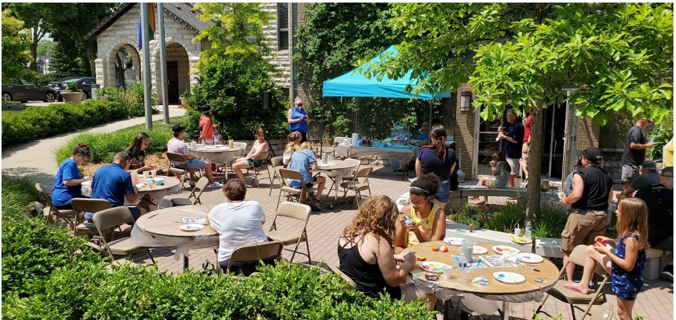
Pride ROCKS drew a large crowd to our Prayer Garden throughout the afternoon; a great outreach opportunity