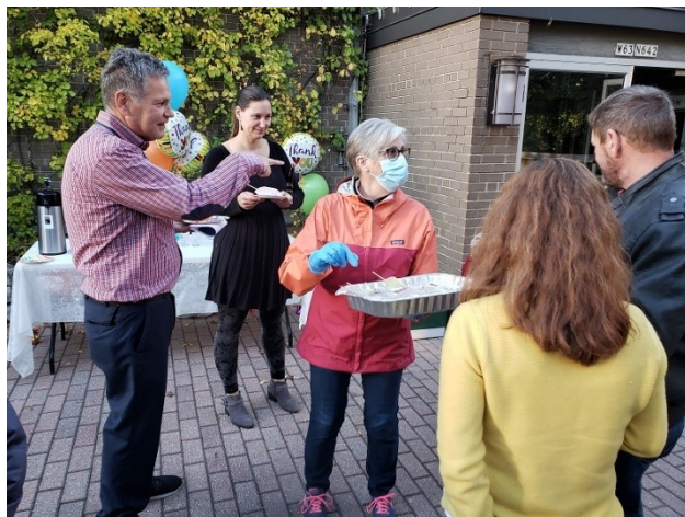
Faith LC members serve appetizers at our autumn Volunteer Appreciation event

We began a series of Joyful Generosity stories, highlighting the personal impact of members who devote their time and talent to Advent. We gathered in the prayer garden for our first annual Joyful Generosity volunteer appreciation social event. On a beautiful October evening, nearly 40 Advent members enjoyed appetizers and drinks prepared by the Stewardship Team and served by friends from Faith Lutheran Church.