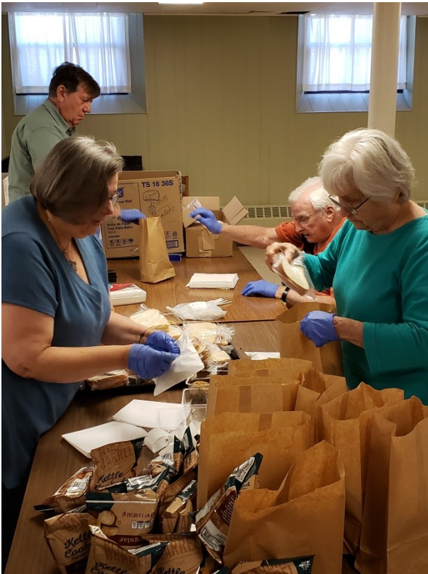
Meals were packed monthly for Cross's meal program

The Cross Lutheran Church monthly lunch program continued in 2021 with bag lunches containing a sandwich, fruit cup, juice box, chips and sweet treat.