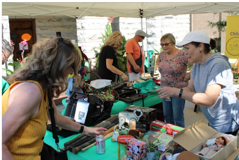
The Rummage Sale did well outdoors with mostly large ticket items for sale