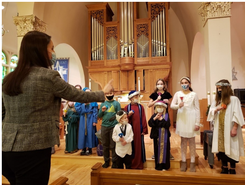
Children's Christmas Program - singing and ringing

Connection — It had been a goal for us coming in to 2021 to find more ways to engage members of all ages in worship leadership, online and in-person. Bringing new faces into these volunteer leader roles allowed people to get to know each other better, and to feel more connected to the church. Families with young children, individuals, and older couples, new members and longtime members, all volunteered to record videos for our online worship, to come help lead worship at Cedar Creek Park, and to serve as ushers, safety greeters, and assisting ministers when we returned back to in-person worship in the sanctuary. I love seeing the schedule when new, first-time, volunteers are signed up to help out, because I know that in serving, they are better connecting with each other and building relationships. And, another way we facilitated more connection and relationship-building was in encouraging a couple of outdoor coffee/ fellowship times, and in holding the Children's Christmas Program at both the 8am and 10:30am worship services.